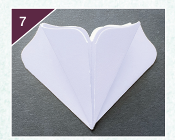
Fold the other top panel in half bringing the fold towards the centre.