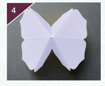
Pinch the panels together on the opposite side, bringing the middle towards the centre of the shape.