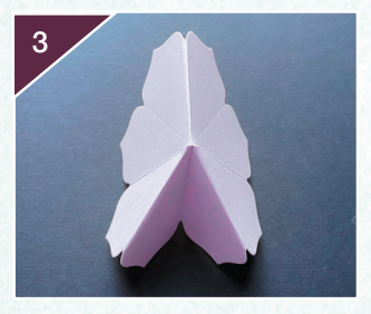
Pinch two panels together bringing the middle towards the centre of the shape.