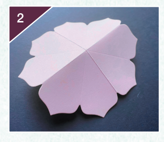
Fold the cut shape in half the opposite way.